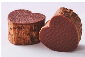
Salted butter caramel 海盐焦糖口味

Traditional salted butter caramel and hazelnut praline from piedmont