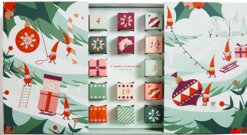
Advent Calendar 圣诞日历礼盒

Box of 24 pieces : Price : 888 RMB Early Bird Price : 688 RMB