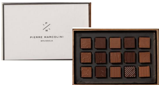
Box of 15 Pralines: 308 RMB