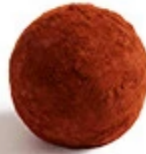
SALTED CARAMEL TRUFFLE

Madagascar vanilla caramel with a hint of Maldon sea salt inside a delicate milk chocolate shell, dusted with cocoa powder