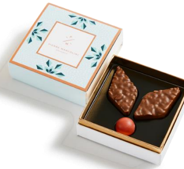
Holly Leaves 冬青叶礼盒

Box of 9 pieces : 218 RMB Box of 12 pieces : 288 RMB Box of 25 pieces : 600 RMB