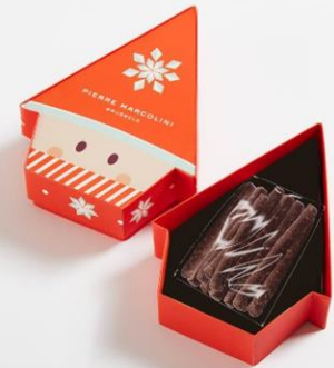
Xmas Elves - Dark Chocolate Pellets Gift box of 70g: 128 RMB