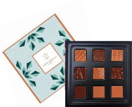
Box of 9 Pralines: 218 RMB

独家巧克力切割工艺，为您展示巧克力甄选原材料绝妙横截面。 初摘馥郁坚果融合巧克力，颗粒饱满层层丝滑。