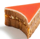
Gianduja puffed rice 榛果脆香米

Pistachio praline, grilled rice, pistachio chips, Montelimar nougat, honey and nougatine.