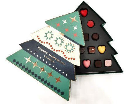
Enchanted Woods 森林奇幻夜礼盒