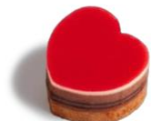
Yuzu mandarin 柚子甜橙

Milk chocolate ganache, yuzu and mandarin ganache, dark chocolate leaves