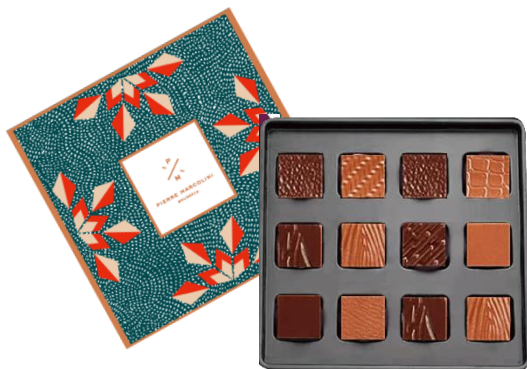
Box of 12 Pralines: 288 RMB