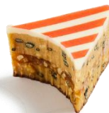
Sesame orange 芝麻橙子

Orange-infused cashew praline with 2 sesames and nougatine.