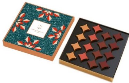
Starred Gianduja 芒星巧克力礼盒

Box of 2 pieces: 58 RMB Box of 11 pieces: 288 RMB Box of 16 pieces: 398 RMB