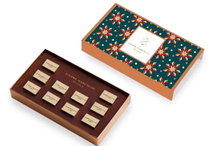
Petits Bonheurs 小确幸礼盒

Box of 5 pieces : 138 RMB Box of 6 pieces: 162 RMB Box of 10 pieces: 288 RMB