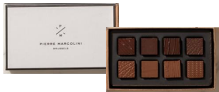
Box of 8 Pralines: 188 RMB