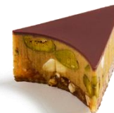
Pistachio nougat 开心果牛轧糖

Orange-infused cashew praline with 2 sesames and nougatine.