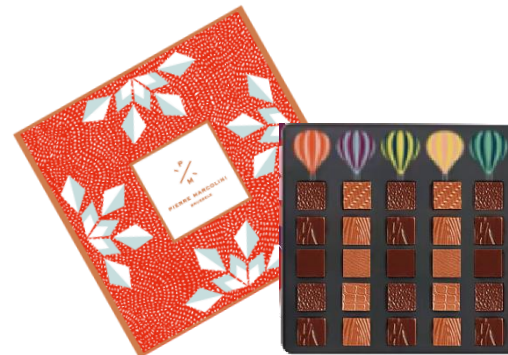
Box of 25 Pralines: 600 RMB