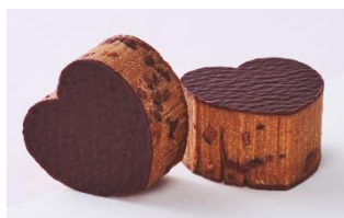
Cocoa grué, 榛果黑巧口味

Tender praline with Piedmont hazelnuts and cocoa grué