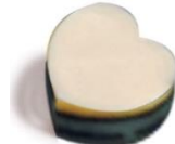
Yuzu Verveine 柚子白巧

White chocolate coating, Yuzu and verveine ganache