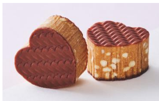
Cashew nut 腰果香草口味

Sweet Vietnamese cashew Praline with subtle notes of fleur de sel