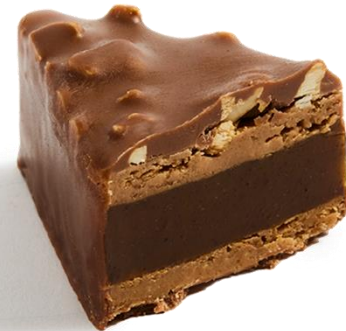
Milk chocolate cashew praline, feuillantine with a salted butter runny caramel, cashew chips and milk chocolate coating