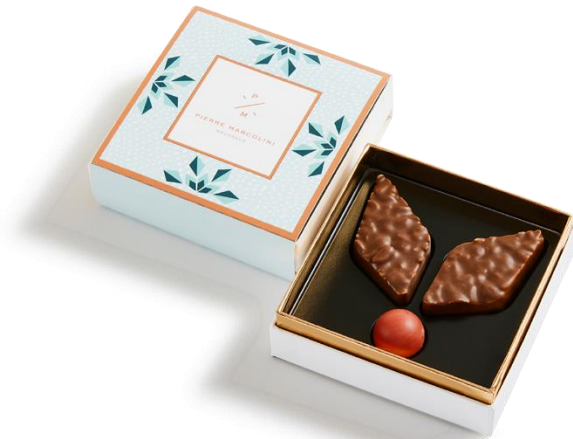
Holly Leaves Box of 3 Pieces: 208 RMB

Wooden boxes combining praliné or caramel bells with generous bites in the shape of holly leaves with cashew nut praliné.