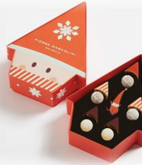
Xmas Elves 精灵礼盒

Box of 24 pieces : Price : 888 RMB Early Bird Price : 688 RMB