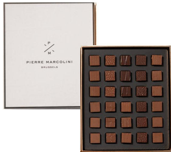
Box of 30 Pralines: 608 RMB